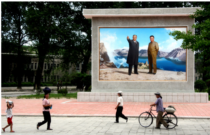
North Koreans pass by a mural of Kim Il Sung (left) and Kim Jong Il (right).

Kim also created a mythology around himself that some experts have likened to a religious cult. North Korea's government told its people that Korea was a chosen land and the site where civilization originated. Images of Kim—known to his people as “The Great Leader”—hung in every shop, home, and subway car. Everything that Kim said became law. No dissent or criticism was permitted. One could be imprisoned for simply sitting on a piece of newspaper with a photo of