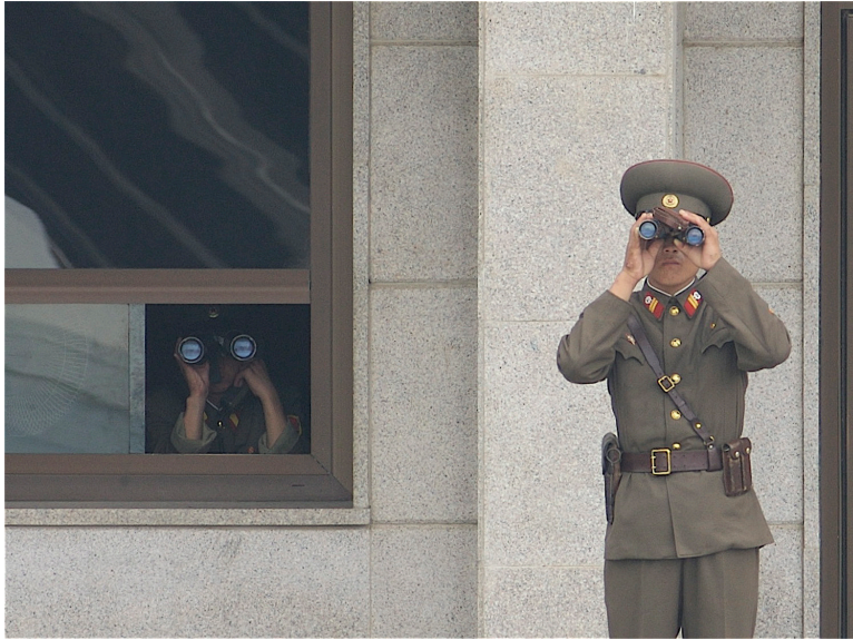
North Korean soldiers look south across the DMZ.

South Korea's President Kim Dae Jung for his policies. In 2000 he was awarded the Nobel Peace Prize. But critics argued that the sunshine policy was helping to prop up a hostile, oppressive regime in North Korea.